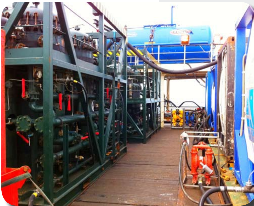
IFV4000 & RFV4000 operating on the Helix Seawell