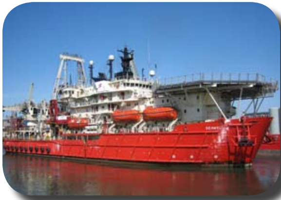
Seawell Light Well Intervention / Dive Support Vessel

For the case, a Hi-Flow™ IFV 4000 skid was coupled with a CrudeSorb® RFV 4000 skid and used with another CrudeSorb® vessel downstream. During a two week period CETCO treated and discharged overboard 9327 bbls (1483 m 3 ) with an average sample inlet of 238 ppm and an overboard average of 5.8 ppm oil in water. This represents average oil in water efficiency removal of 97.5%. One set of consumables lasted for the duration of the project.