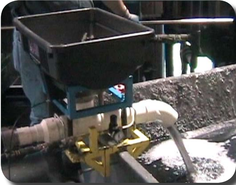
Latex flowing through LiquiSorb feeder mounted to dump cart (left)

LiquiSorb® is capable of absorbing up to 250x its weight in water