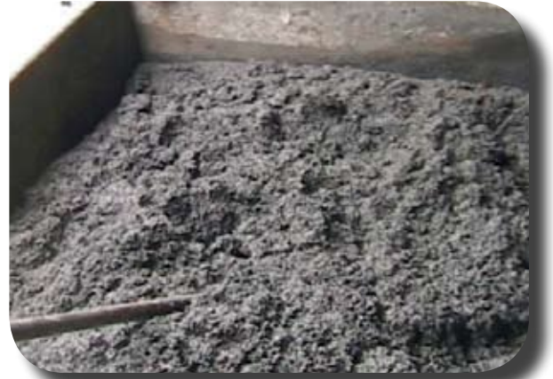
Tire chord latex solidified with LiquiSorb 200 (below)